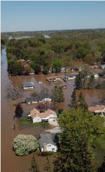
May 2020 Saginaw Flooding

There are three layers of emergency preparedness and response – county (local), regional and state. Covenant participates in the Saginaw County Emergency Preparedness Council, Local Emergency Planning Committee (LEPC) and Region 3 HealthCare Coalition. We work with the state as necessary, which is all tied in together on the health care preparedness side and the state police side.